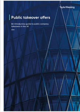
Public takeover offers