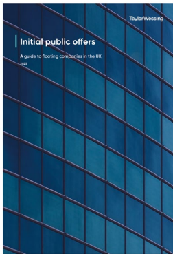
Initial public offers

Access more detailed guidance across key corporate finance areas.