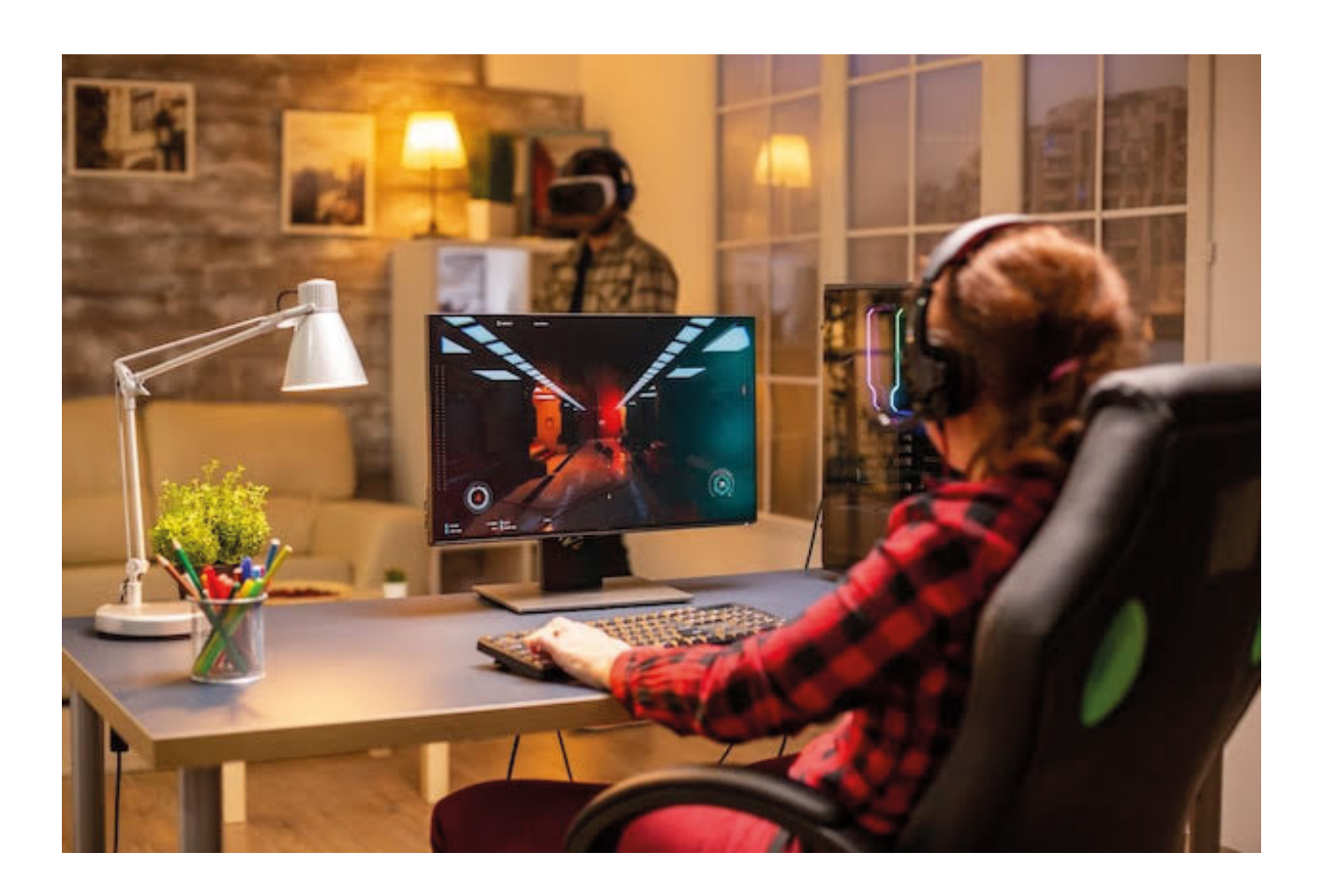
4.2.3. Audiovisual media service providers - television channels, video-sharing platforms, and streaming channels

Considering that the video game is owned by the publisher and that the publisher has control over the exploitations realised by the video game, it would not be strange that in the future certain obligations or commitments could be demanded from them in order to avoid conflicts of competition such as, for example, vertical mergers.